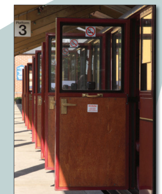
Mind the doors!

Right: Into the light. A few minutes south of Aylsham a tunnel carries the line under the main road. Blickling Hall is seen here emerging into daylight heading northbound.