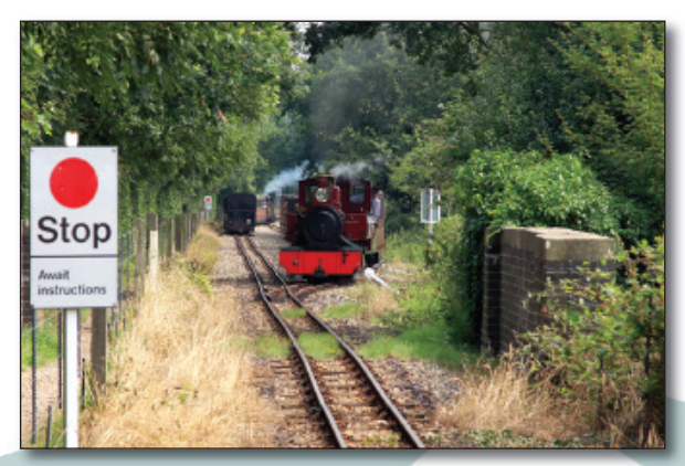
Brampton loop. Mark Timothy swings back onto the single track at Brampton as Blickling Hall heads south pulling The Broadsman.