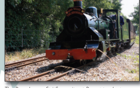
The Broadsman. Spitfire waits at Brampton loop for permission via the radio to enter the next section of track.

Right: Into the light. A few minutes south of Aylsham a tunnel carries the line under the main road. Blickling Hall is seen here emerging into daylight heading northbound.