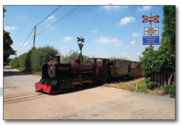
Belaugh Green. Situated just north of Wroxham, the level crossing at Belaugh (pronounced 'be-low') Green is ungated, as indeed are all the crossings on the line.