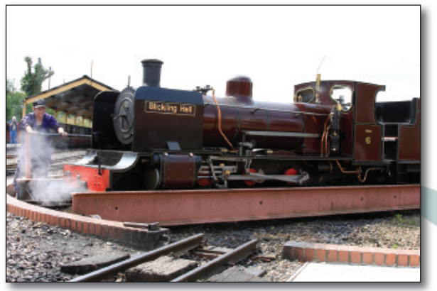
Aylsham turntable. There are turntables at both ends of the line, each within view of the platforms.