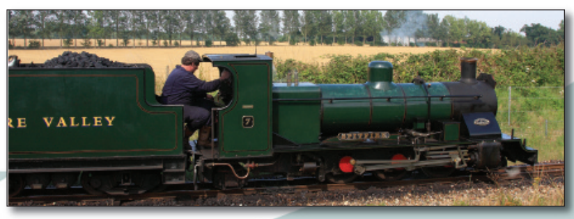
Elegance. Not as fast as the famous fighter aircraft but just as elegant, Spitfire leaves Buxton at 15.42 on its way to Wroxham.